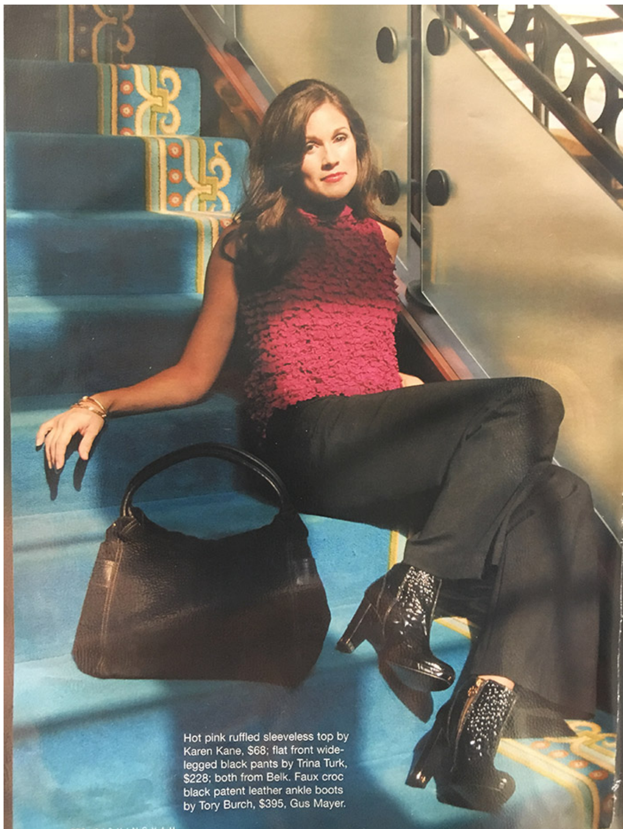
Hot pink ruffled sleeveless top by Karen Kane, $68; flat front wide-legged black pants by Trina Turk, $228; both from Belk. Faux croc black patent leather ankle boots by Tory Burch, $395, Gus Mayer.